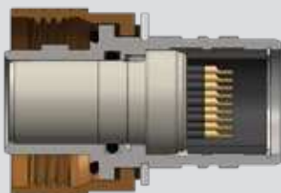
Cable Connector Plug (CCP)