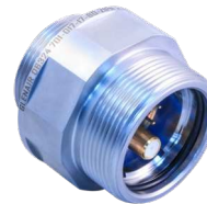
Series 701-017 Bulkhead Connector Receptacle (BCR) supplied as discrete connectors or in pigtail assemblies