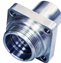
Series 701-016 Flange Connector Receptacle (FCR) supplied as discrete connectors or in pigtail assemblies