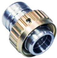
Series 701-011 Cable Connector Plug (CCP) supplied as overmolded cables only

These connectors withstand up to 5,000 PSI hydrostatic pressure in a mated condition.