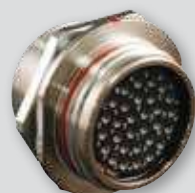
Rear Panel Mount , Jam Nut