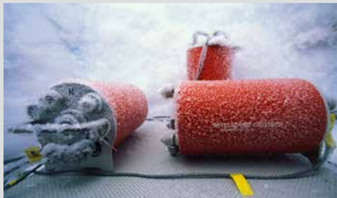
Seismometer, geophysical observatory, Neumayer Station, Antarctica