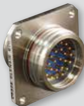
Square Flange (FCR)