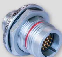
Series 802 Jam Nut Mount