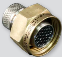
Series 802 Plugs