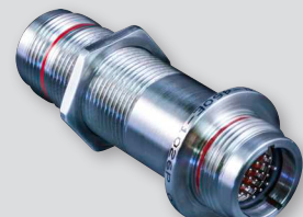
Series 802 Hermetic Bulkhead Feed-Thru