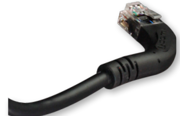
CAT 5e, 45°