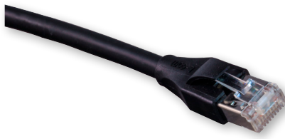
CAT 5e, Straight