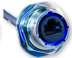
Jam-nut mount Receptacle