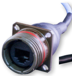
Wall Mount Receptacle with round holes