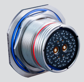
Combo Insert Arrangements

Glenair SuperNine hermetic connectors are designed to meet or exceed military specification performance requirements. Glenair also manufactures and supplies hermetic connectors for most every military standard connector currently in use including: