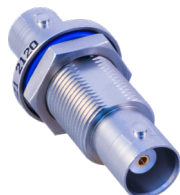
GRF05-0002 Page 98