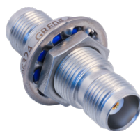
GRF05-0005 Page 100