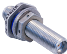
GRF01-0003 Page 103