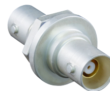
GRF05-0004 Page 99