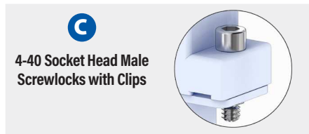
TABLE 1 SCREWLOCK OPTIONS

TAG Ring shield termination. 557-553 backshell fits M24308 D-Subminiature connectors. TAG ring has slots for individual wire shields. Gold-plated copper alloy spring and PTFE friction washer. Backshell body is aluminum, screws and clips are stainless steel.