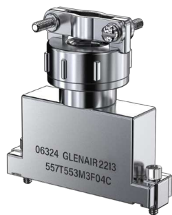
T Top Entry