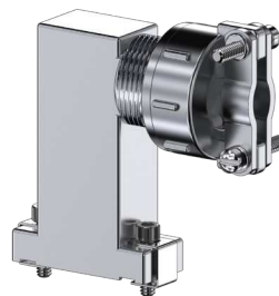
E End Entry