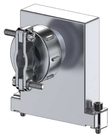
S Side Entry