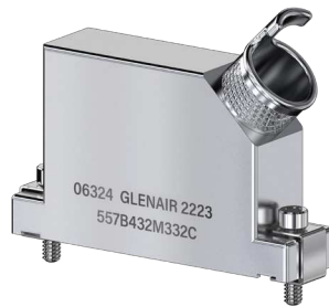
B 45° Entry