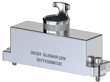
T Top Entry