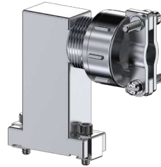
E End Entry