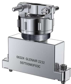
T Top Entry