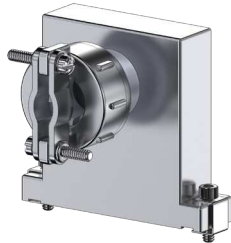
S Side Entry