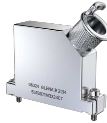
B 45° Entry