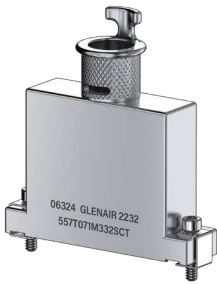
T Top Entry