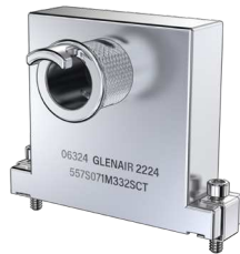
S Side Entry