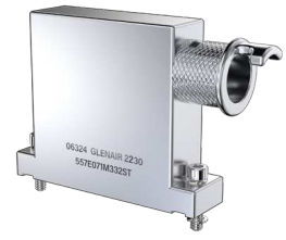
E End Entry