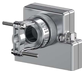
S Side Entry