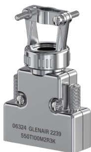
T Top Entry