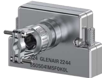
S Side Entry