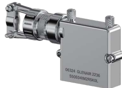
E End Entry