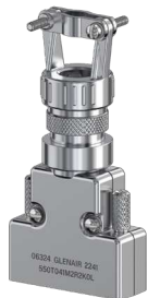
T Top Entry