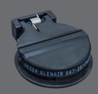
Low-profile non-locking designs for use with recessed quick-disconnect connectors