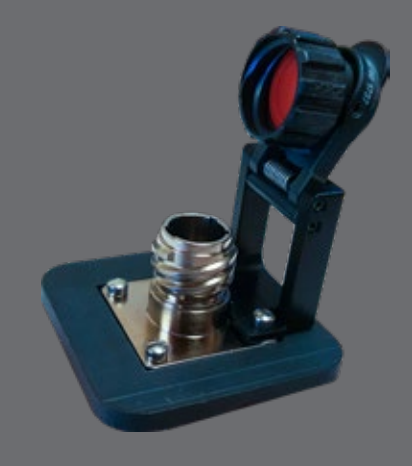
Jam nut and wall mount configurations available in all styles