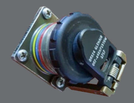
Full environmental threaded / twist-lock seal