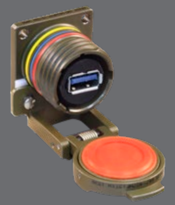
Suitable for all circular designs including commercial USB / RJ45 interfaces