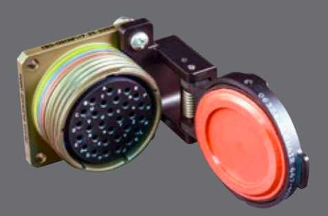
Self-aligning gimbal-action face seal