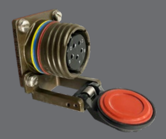
ProSeal cover shares connector mounting holes and hardware