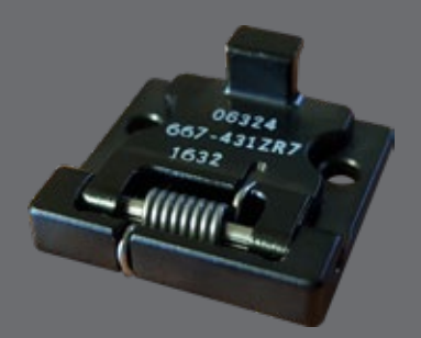
Anti-vibration and shock spring-action performance