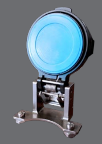
Dual-action mechanism: cover locks in open position and holds tight in closed position