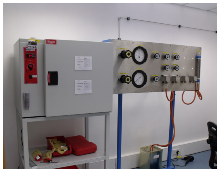
Pure air compatibility test equipment