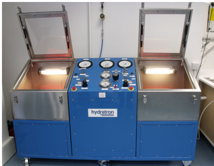
Pressure test rig