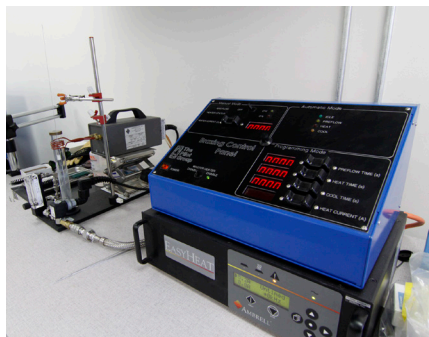
Brazing control panel

Solutions built to exact customer requirements and specifications