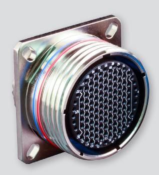
D38999/20 Wall mount receptacle