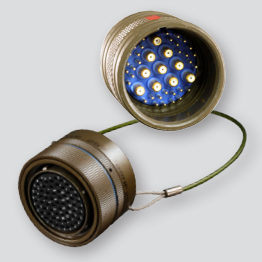
Quick-disconnect push-pull and lanyard-release mating