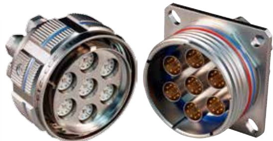
SuperNine® Plug and Receptacle