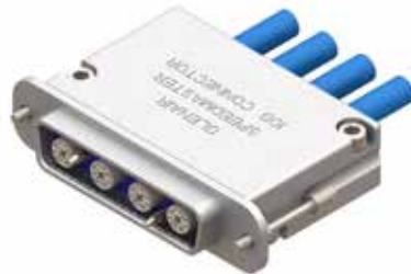
HiPer-D Rectangular (M24308)