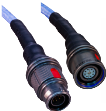
Mighty Mouse Locking Push/Pull Plug and Receptacle