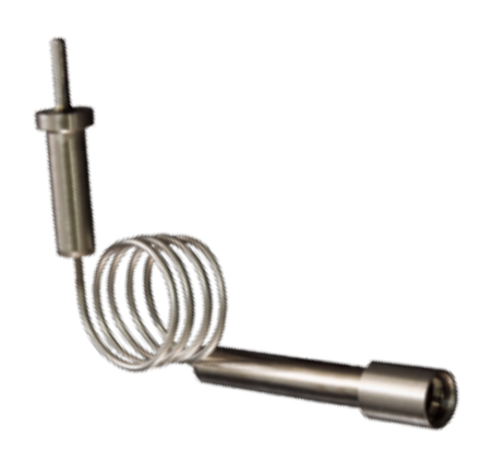
831-002 #12 Assembly for MIL-DTL-38999 Series II, Series 79 and Series 80 Mighty Mouse

Series 831 GT assemblies provide passage of nitrogen and other pure, pressurized gases through standard MIL-DTL-38999 Series II as well as Glenair Series 79 and 80 environmental connectors. These snap-in, rear-release assemblies feature precision stainless steel gas contacts brazed to semi-rigid stainless steel tubing. The assemblies are fabricated using a fluxfree brazing process, ultrasonically cleaned and packaged in a sealed, dust-free environment. Available with #12 AWG gas contacts, these assemblies are supplied with two different tubing sizes, and may be ordered in single ended or pin-to-pin, pin-to-socket and socket-to-socket configurations. Consult factory for available off-the-shelf lengths or use the part number to specify a made-to-order length.