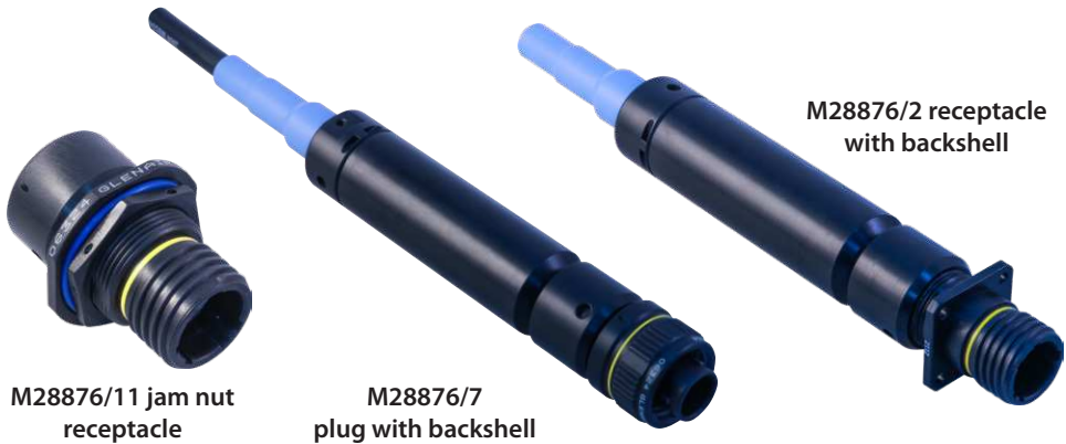
M28876/11 jam nut receptacle