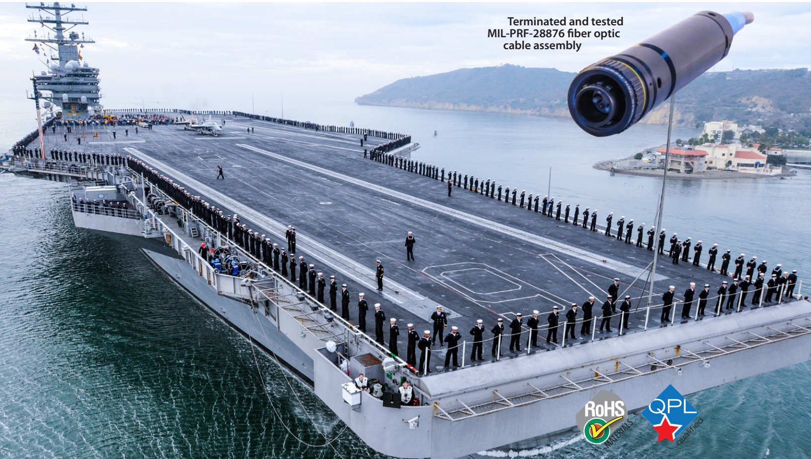
Terminated and tested MIL-PRF-28876 fiber optic cable assembly

NAVSEA-qualified MIL-PRF-28876 connectors and M29504/14 and /15 termini