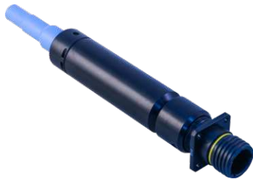
Receptacle with straight backshell