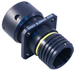
Receptacle without backshell