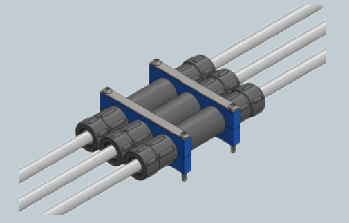
PowerBlock HV High Current Power Feeder System