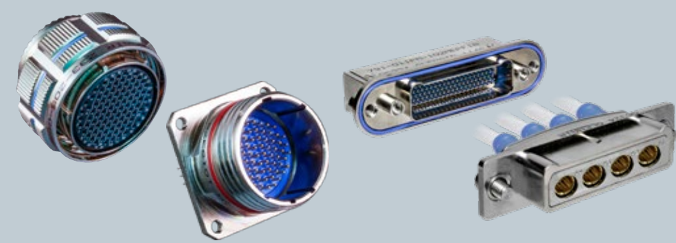
Series 806 micro miniature avionic and sensor connector