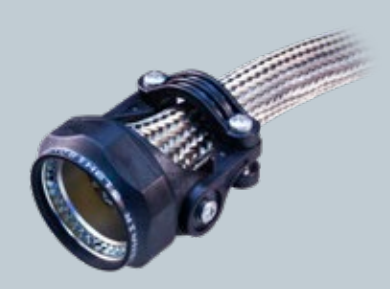
Shield termination connector backshells with integrated EMI/RFI shielding