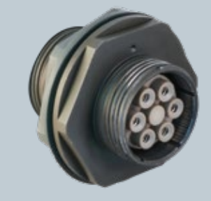
Series 972 PowerLoad plug and jam nut receptacle

PowerLoad<sup>™</sup> is an innovative power distribution connector designed for high-voltage, high-current, and high-frequency applications. An innovative combination of low-resistance contacts and a one-piece composite thermoplastic insulator with aggressive contact-cavity isolation results in a reliable power distribution solution that optimizes wire-to-contact termination and weight reduction in power distribution cables. Ideally suited for use in lithium battery propulsion systems, PowerLoad is available in three- and six-contact layouts for both multiphase and high-frequency power applications. Removable wire-sealing grommet and wire separator allow for easy rear release of contacts and improved sealing of tape-wrapped wire.