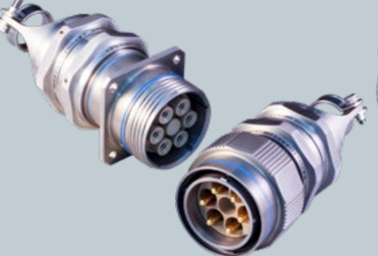
PowerLoad high-current, high-voltage power distribution connectors