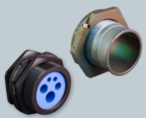
Bulkhead cable feed-thrus with wire management grommets