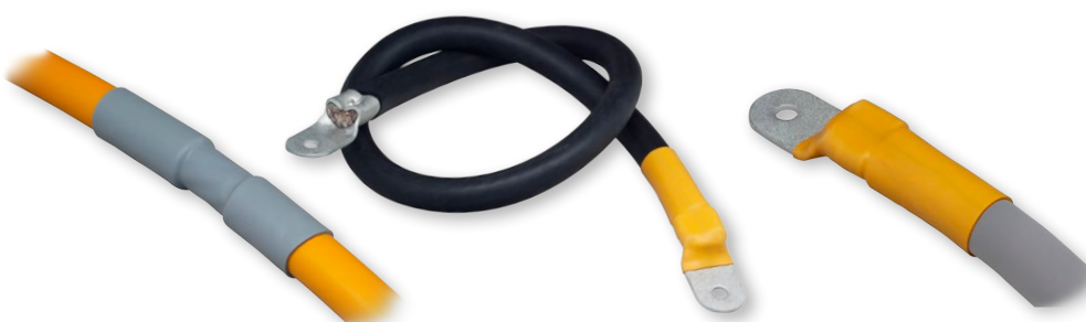
Fast and easy repair of Duralectric-jacketed cables

Designed for rugged weathering, UV and ozone-resistant performance, Glenair AutoShrink is the one-piece easy-action solution for Turboflex™ cable and lug termination, splice insulation, and Duralectric® jacketing repair. Universal design AutoShrink tubing delivers reliable and durable sealing as well as mechanical protection for cable end terminations in harsh military and industrial applications. Built from Glenair Duralectric material, AutoShrink is fully hydrophobic and resistant to caustic chemicals and solvents. Easy-action spiral hold-out and large cold shrink ratio makes for fast installation and durable, split-resistant performance.