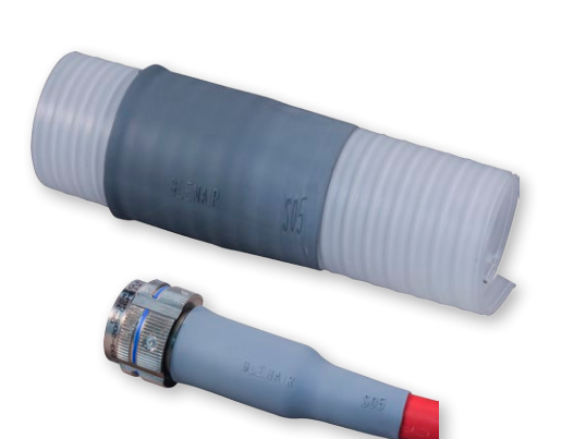
Sneak Peek: AutoShrink Boots Fast, easy-to-install environmental sealing for cable-to-connector terminations. No heat gun needed! Designed for use with Duralectric cable jacketing. Consult the factory for available sizes, styles, and colors.