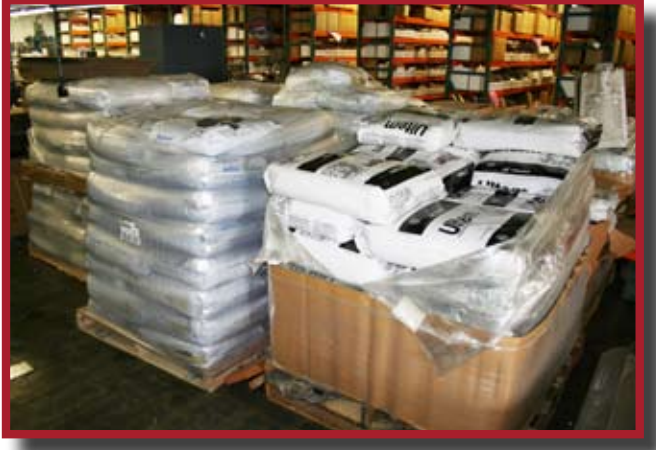
Glenair stocks an abundant supply of the composite materials used in the fabrication of our parts.

modulus and broad chemical resistance. Ultem 2300 is a 30% glass filled thermoplastic which displays excellent property retention and resistance to environmental stress. It can be further reinforced with conductive fibers, or plated, for EMI resistance. Ultem performs in operating environments up to 378° F (192° C) long term and 410° F (210° C ) short term. Ultem meets ASTME595 outgassing, 14 CFR Part 25 flammability, and zero halogen outgassing requirements.