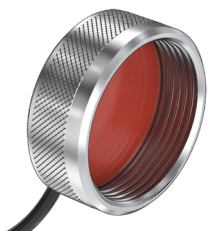
TABLE 1 MATERIAL / FINISH