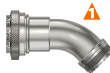
Extender Backshell, Self-Locking, Expanded Clearance 320V*030 Page 32-21