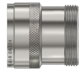
Extender Backshell, Direct Coupling 320DS002 Page 32-7