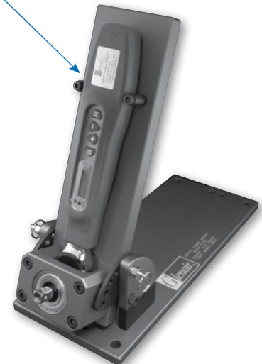
Shown with 600-161 Digital Torque Wrench in Position