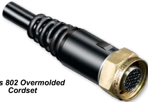
Series 802 Overmolded Cordset

Abrasion-Resistant Polyurethane Jacket provides cold temperature flexibility and high strength. Low smoke/zero halogen material meets requirements for low toxicity.