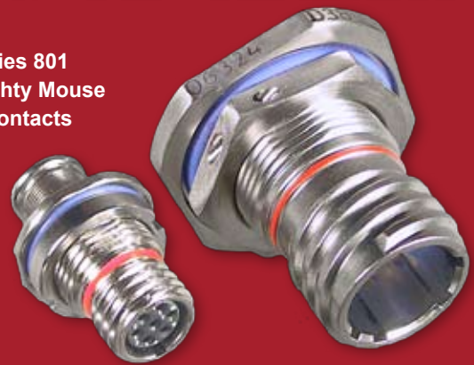
MIL-DTL-38999 6 Contacts

The Series 801 Connector offers up to 71% weight savings and 52% size reduction when compared to D38999 Series III Connectors.