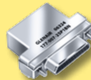
Shorting Adapters Page N-3

Combining a switching backshell and a Micro-D connector, these assemblies have all contacts shorted to each other. These shorting plugs provide ESD protection to sensitive instrumentation.