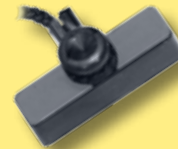
Rubber Covers Page N-7

For protection of Micro-D's used in tactical equipment, these synthetic rubber covers are friction-fit and attach with nylon cord and ring terminals.