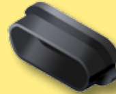
Dust Caps Page N-4

Always in stock, these anti-static black LDPE dust caps protect Micro-D connectors from debris and damage. All Glenair Micro-D connectors are furnished with these dust caps; however, these caps may be purchased separately for replacements.