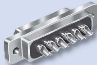
Combo Solder Cup Page E-3

Nonremovable solder cup #16 power contacts for termination to #16 AWG or smaller wire. Micro pins accept #26 AWG or smaller wire. Gold plated contacts are backfilled with rigid epoxy.