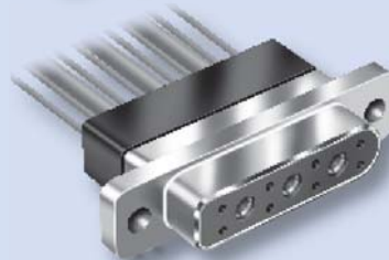
Combo Pre-Wired Page E-6

Crimp contacts are terminated to insulated Teflon® wire. Connectors are backpotted with epoxy, providing strain relief and environmental protection.