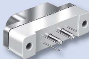
Combo Board Mount Page E-9

Ideal for flexible or rigid circuits, these vertical mount connectors feature high temperature materials to withstand soldering heat. A full range of hardware options is available.