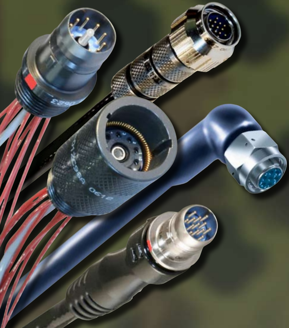
Series 800 UNF Thread