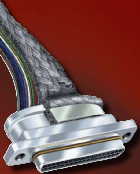
MIL-DTL- 83513 Micro-D