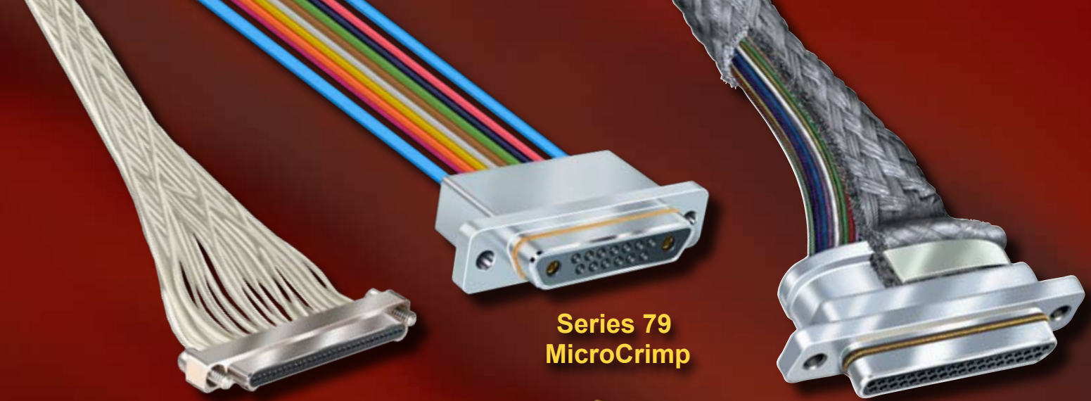
Series 79 MicroCrimp