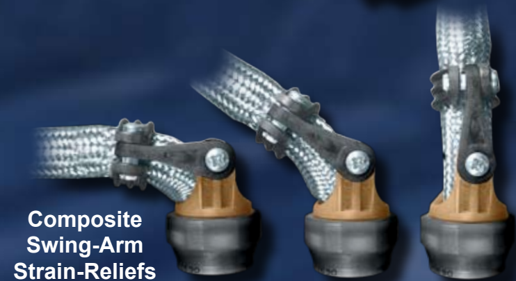
Composite Swing-Arm Strain-Reliefs