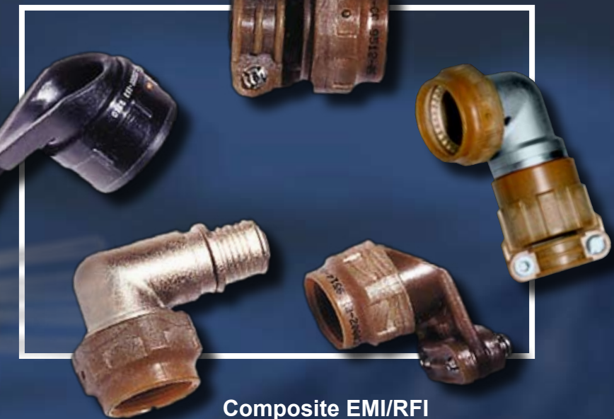
Composite EMI/RFI Backshells and Strain-Reliefs