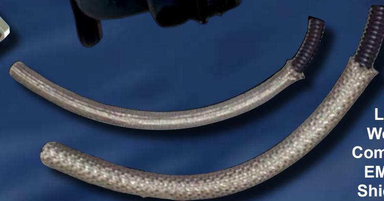
Light Weight Composite EMI/RFI Shielding