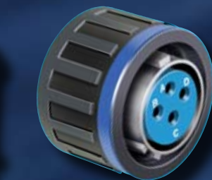
Ruggedized Composite Connectors