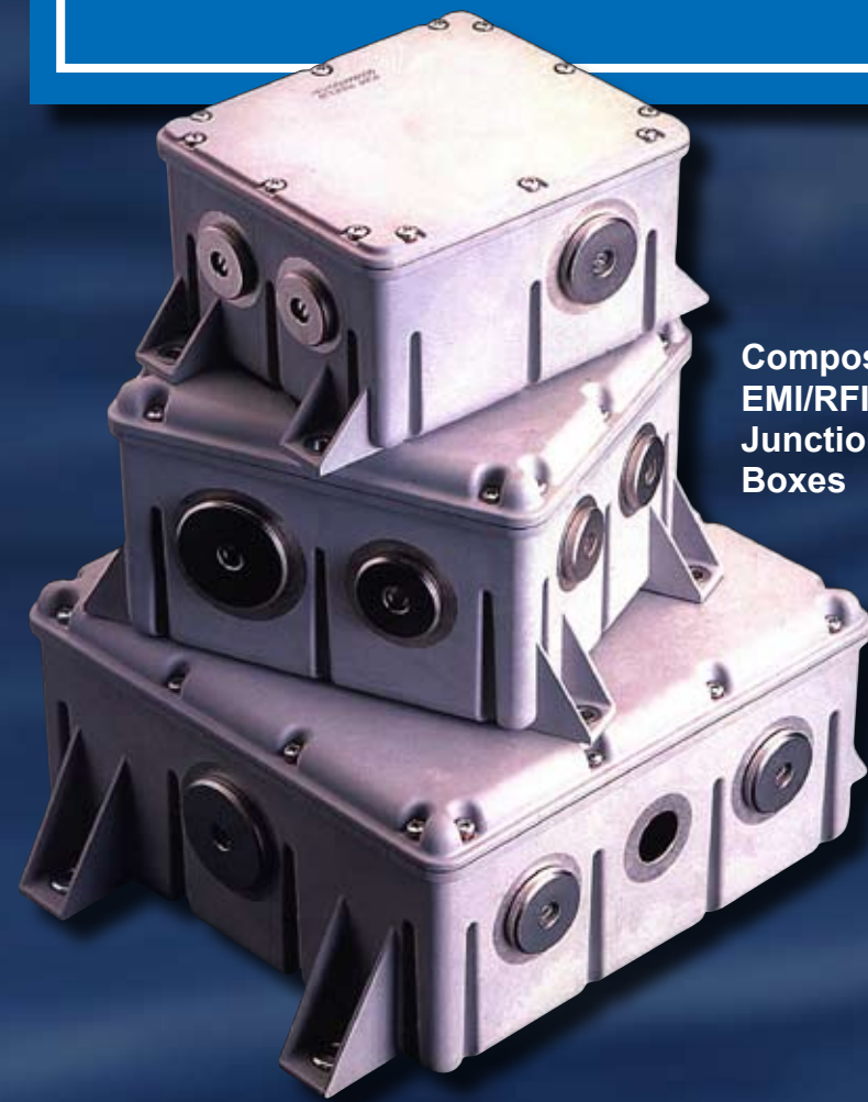
Composite EMI/RFI Junction Boxes

N obody makes as many types and sizes of weight saving, corrosion-proof composite interconnect components as Glenair. Our parts are manufactured from high-grade engineering thermoplastics and have been qualified in test after test to the most rigorous military and industrial standards. Conductive versions are available for systems which require electromagnetic compatibility. Please see www.glenair.com/composite for complete information.