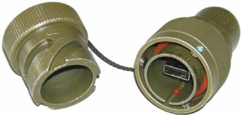
Figure 1 ITS with USB-A Memory Key