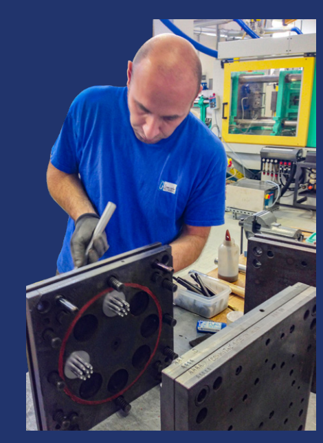
TOTAL VERTICAL INTEGRATION includes In-house rubber and thermoplastic injection molding.

Space-compliant gold and nickel plating performed in-house. Hermetic seal connector fabrication with performance levels to 1 X 10<sup>-7</sup> helium leak rates.