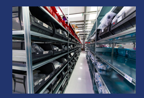
SAME-DAY SHIPMENT STOCKING

Immediate availability for highdemand connectors and tooling.