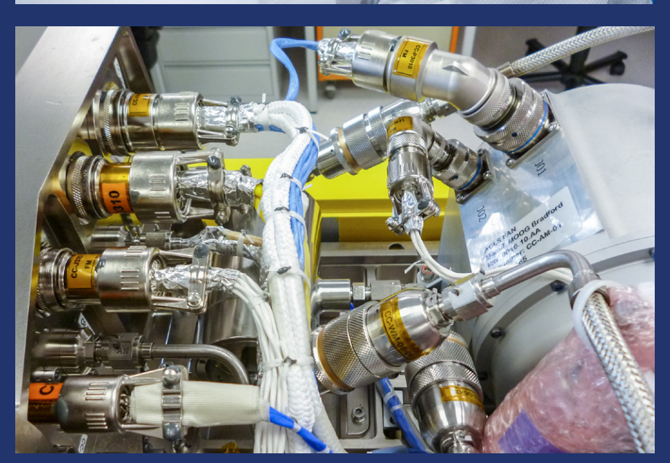
SPACE-GRADE HARNESS FABRICATION AND INTEGRATION In-house or at customer facility.