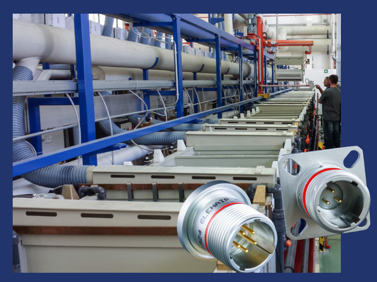
ADVANCED HERMETIC SEAL AND CONNECTOR PLATING CAPABILITIES

Space-compliant gold and nickel plating performed in-house. Hermetic seal connector fabrication with performance levels to 1 X 10<sup>-7</sup> helium leak rates.