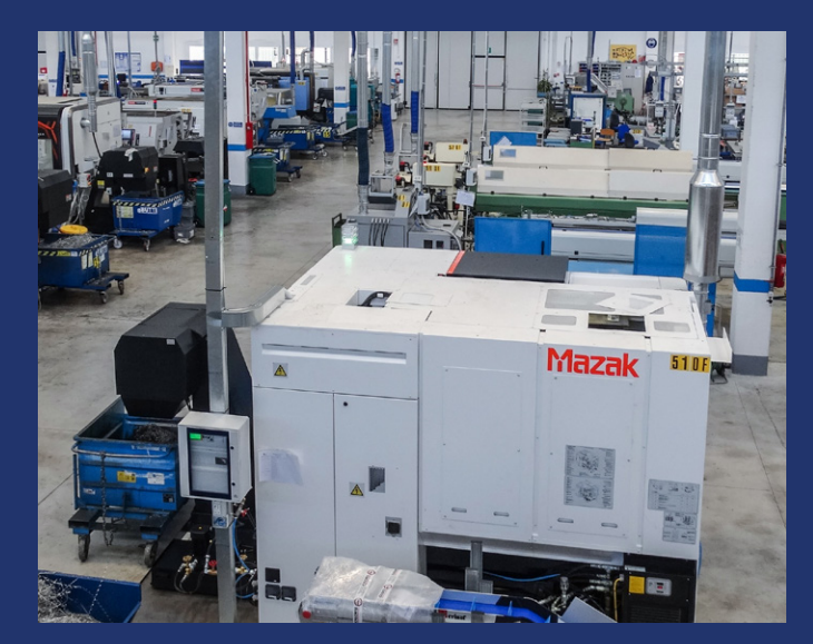
HIGH-CAPACITY CNC MACHINING CENTERS allow Glenair BLQ to provide lightning-fast turnaround on small and custom orders as well as large production runs, all with superior surface finishes and better part quality.