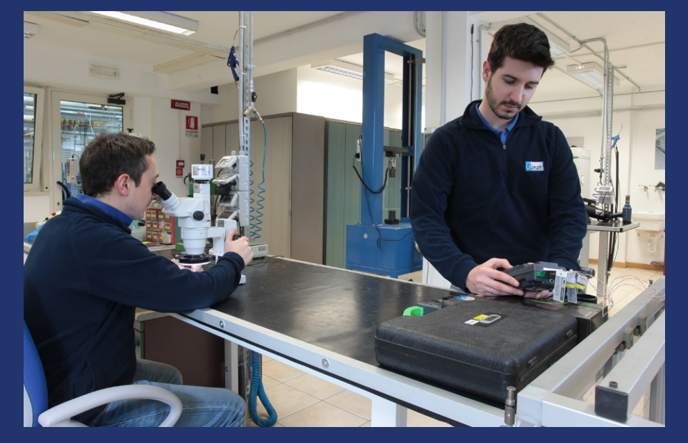
IN-HOUSE TEST LAB

with capabilities for both high-voltage as well as high-speed signal product qualification. Credentials include ISO 17025 and others.