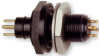
Male Bulkhead Connector