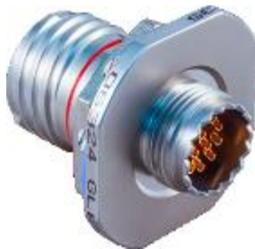
Jam-Nut Hermetic Receptacle P/N 233-100-H7