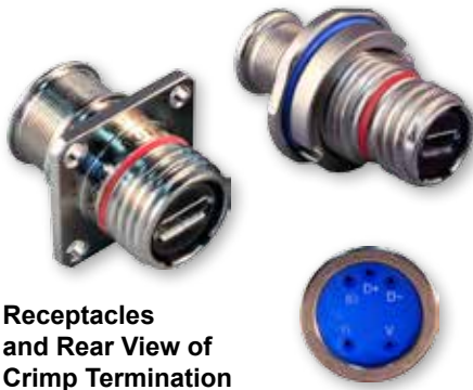
Receptacles and Rear View of Crimp Termination