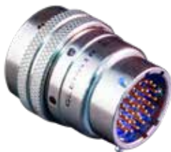
MIL-DTL-38999 Series I Bayonet-Lock Sav-Con