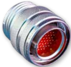
SuperNine MIL-DTL-38999 Series III Type In-Line Plug/ Receptacle Sav-Con