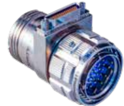
SuperNine Special Application Sav-Con's Solving Unique Customer Problems