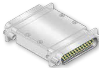
HiPer-D® Gender Changer