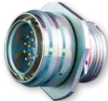
SuperNine MIL-DTL-38999 Series III Type Bulkhead Feed- Thru Gender Changer / Sav-Con