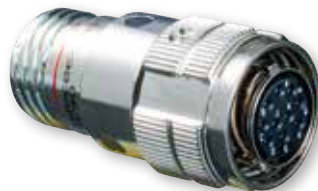
MIL-DTL-38999 Series III Type Filtered Adapter