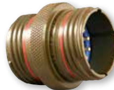
SuperNine MIL-DTL-38999 Series III Type In-Line Sav-Con Gender Changer