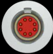
SuperFly Datalink Red