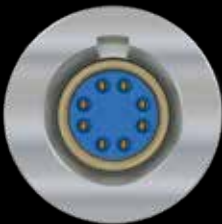
SuperFly Datalink Blue