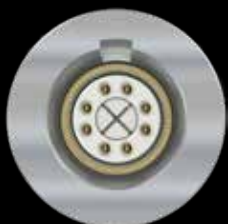
SuperFly Datalink White

Quick-disconnect “push-pull” versions are ideal for tactical gear. Threaded-coupling versions are intended for aircraft and space-grade applications where secure mating is a requirement.