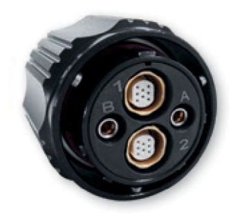
28-OB4 2 OCTOBYTE 2 SIZE 8 CONTACTS