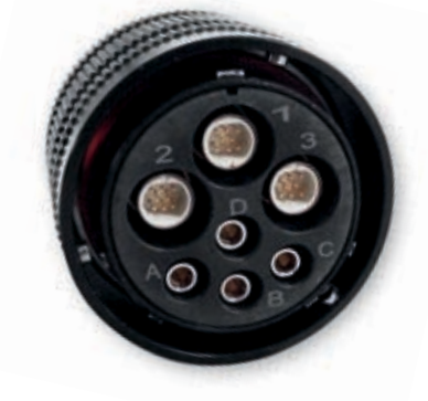
36-OB7 3 OCTOBYTE 4 SIZE 8 CONTACTS