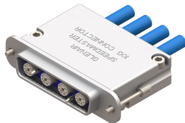
HiPer-D Rectangular (M24308)