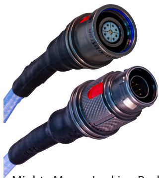
Mighty Mouse Locking Push/Pull Plug and Receptacle