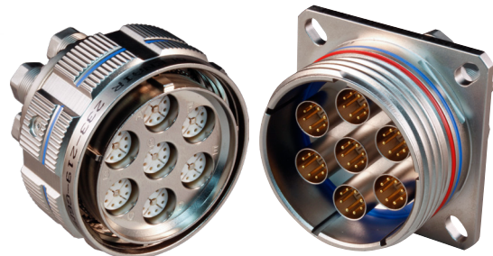
SuperNine Plug and Receptacle