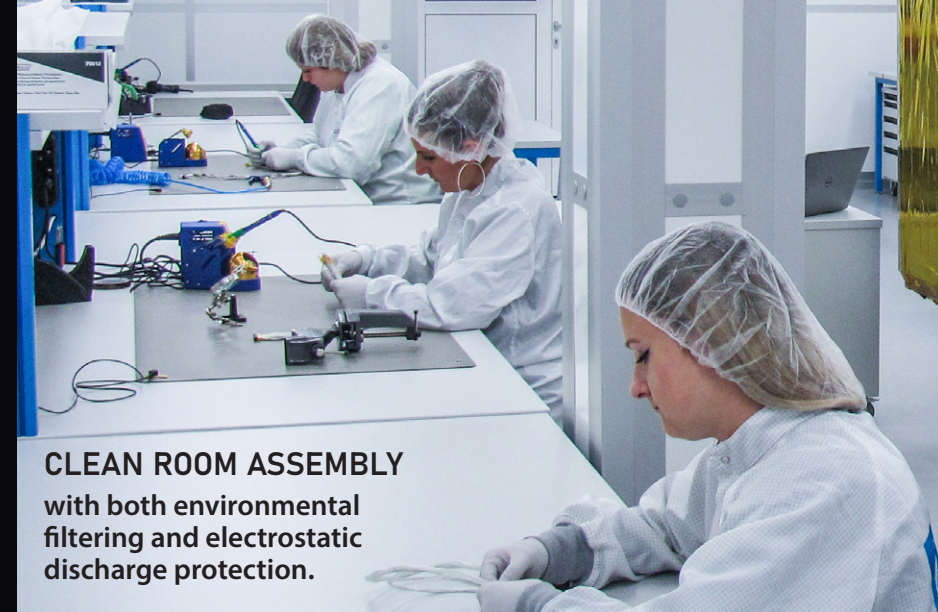
CLEAN ROOM ASSEMBLY with both environmental filtering and electrostatic discharge protection.