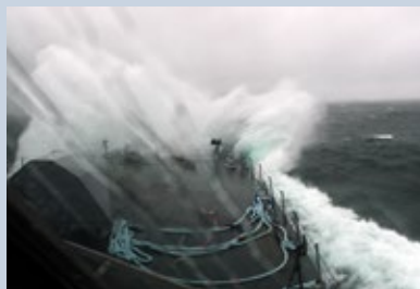
Glenair MIL-DTL-24749 Rev. C Type IV Stainless Steel/Nickel Ground Straps: US Navy qualified and tested to survive extreme environments