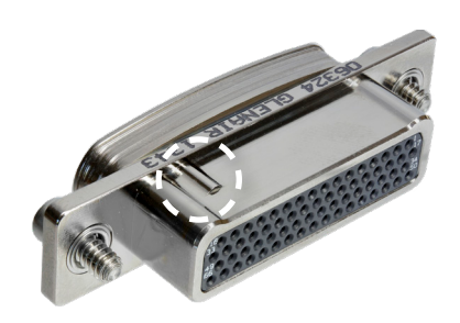
Plug connector with key at position A