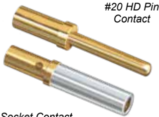
#20 HD Pin Contact