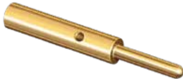
#20 AWG Wire Adapter

Size #22 AWG wire is the largest wire size that fits standard size 23 contacts. Use this adapter to attach larger #20 gage wire. First, crimp wire to adapter, then crimp the adapter into the size #23 contact. Adapters are made of tellurium copper alloy #1452, and are gold plated. Crimp with M22520/1-01 tool and 809-138 (Daniels TH653) positioner. These adapters cannot be removed from connectors.