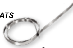
Band-Master™ ATS Microband 601-061