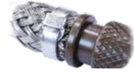
Add a boot or overmold for environmental protection (shown without boot)

These adapters are for use with Band-Master™ ATS Micro Band shield termination straps. Choose the smallest cable entry for your wire bundle.