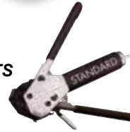
Band-Master™ ATS Micro Band Tool 601-101

These adapters are for use with Band-Master™ ATS Micro Band shield termination straps. Choose the smallest cable entry for your wire bundle.