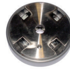
Die For Pneumatic Crimp Tool Type B