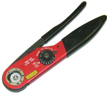
Manual Crimp Tool