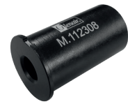
Locator for Pneumatic Crimp Tool Type B