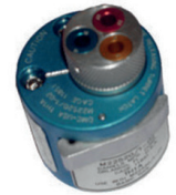
Turret for Pneumatic Crimp Tool Type A