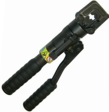
Hydraulic Crimp Tool