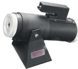
Pneumatic Crimp Tool Type B