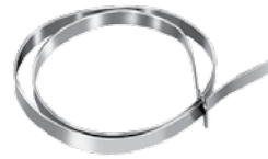
Standard Band Tool Part Number 600-058 1.18 lbs. / 6.75 Inches (172mm.) Length