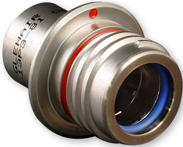
220-13 Scoop-Proof Shell